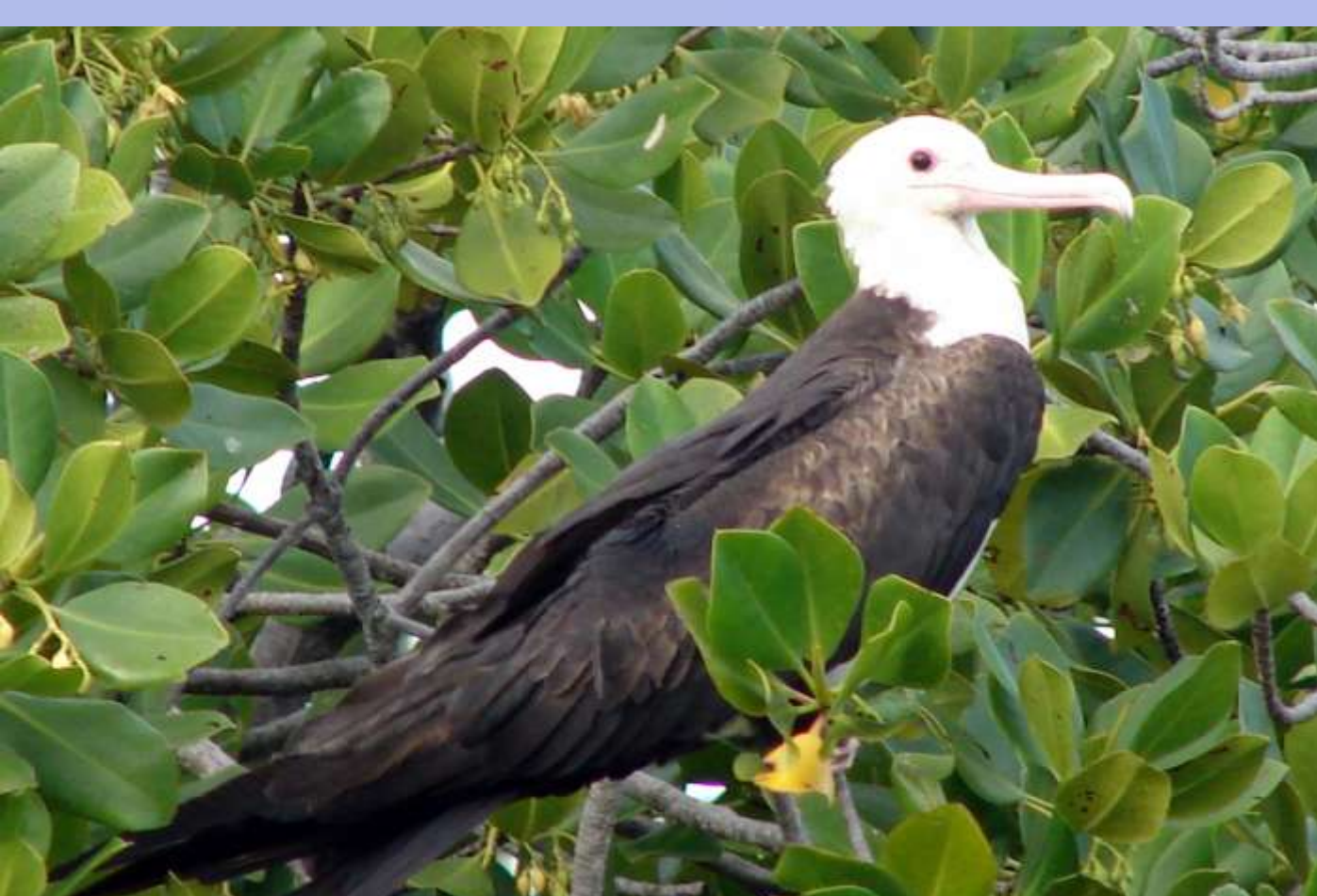
Lesser Frigatebird Fregata ariel Distribution in Seychelles: occurs throughout Seychelles, breeds only on Aldabra Population: about 6,000 breeding pairs