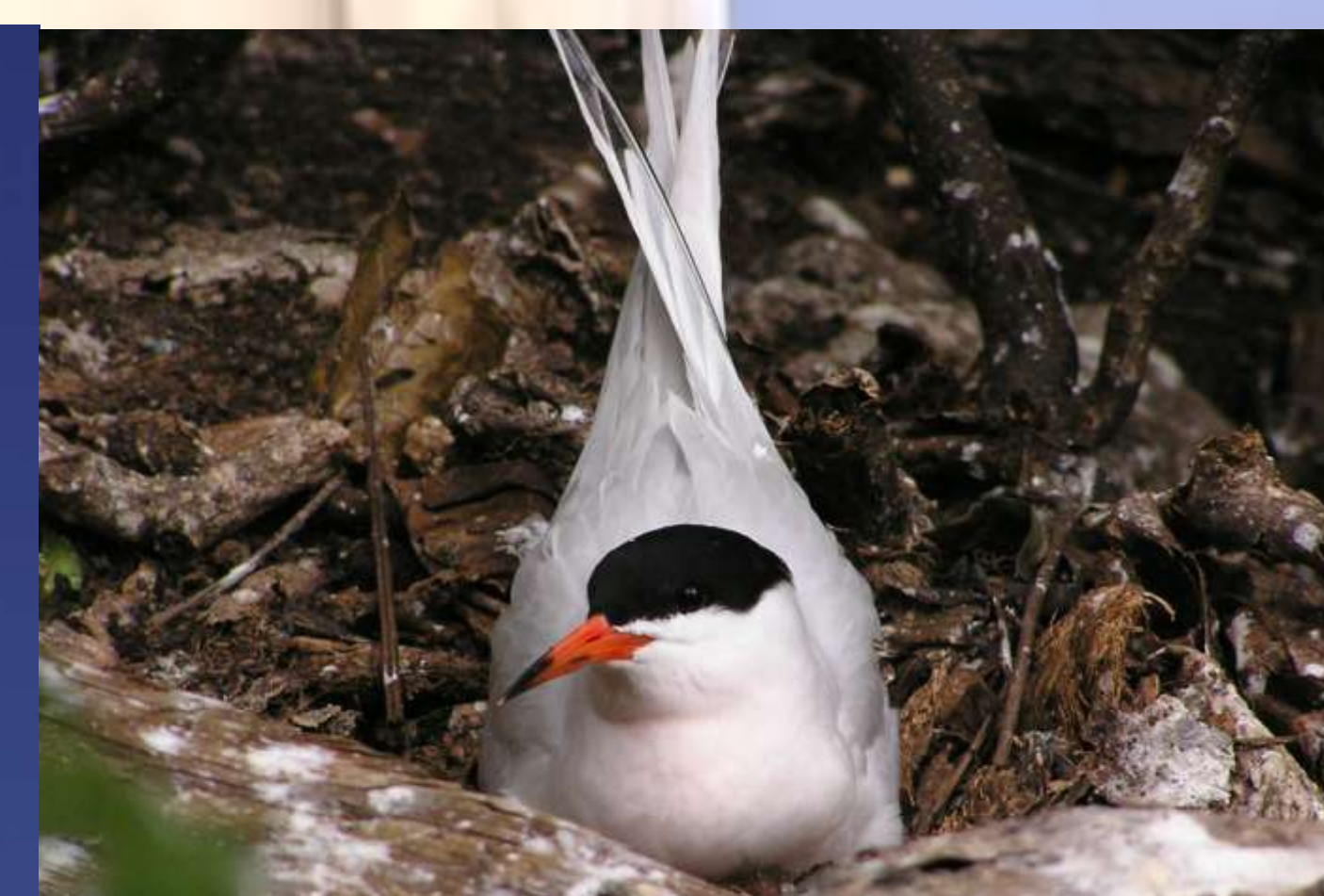
Roseate Tern Sterna dougallii Distribution in Seychelles: breeds on Aride, with small populations on two of the Amirante Islands Population: breeding population of about 1600 pairs