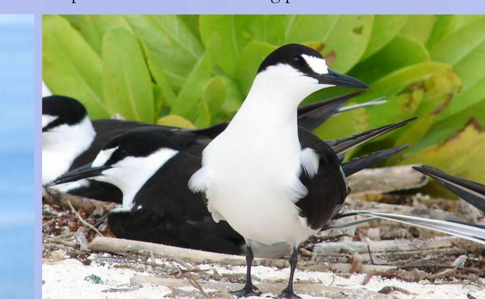
Distribution in Seychelles: breeds on Aride, Bird, Cousine, Récif and other small islands, and some coral islands to the South (African Banks, Cosmoledo, Desnoeuvs) Population: At least 5 million pairs