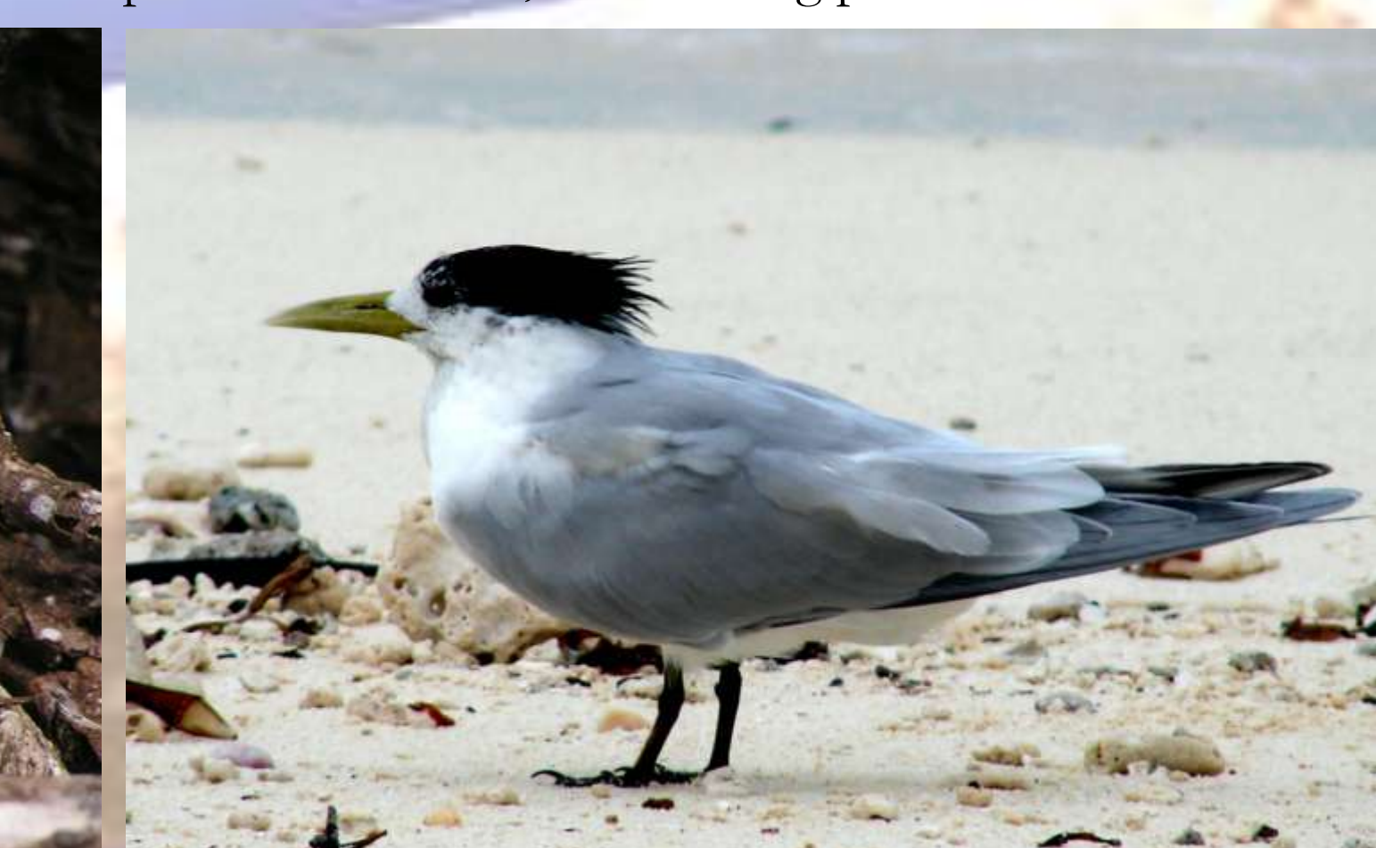
Greater Crested Tern Thalasseus bergii Distribution in Seychelles: breeds on Aldabra and Amirantes; outside breeding season, occurs throughout Seychelles. Population: 300-700 breeding pairs