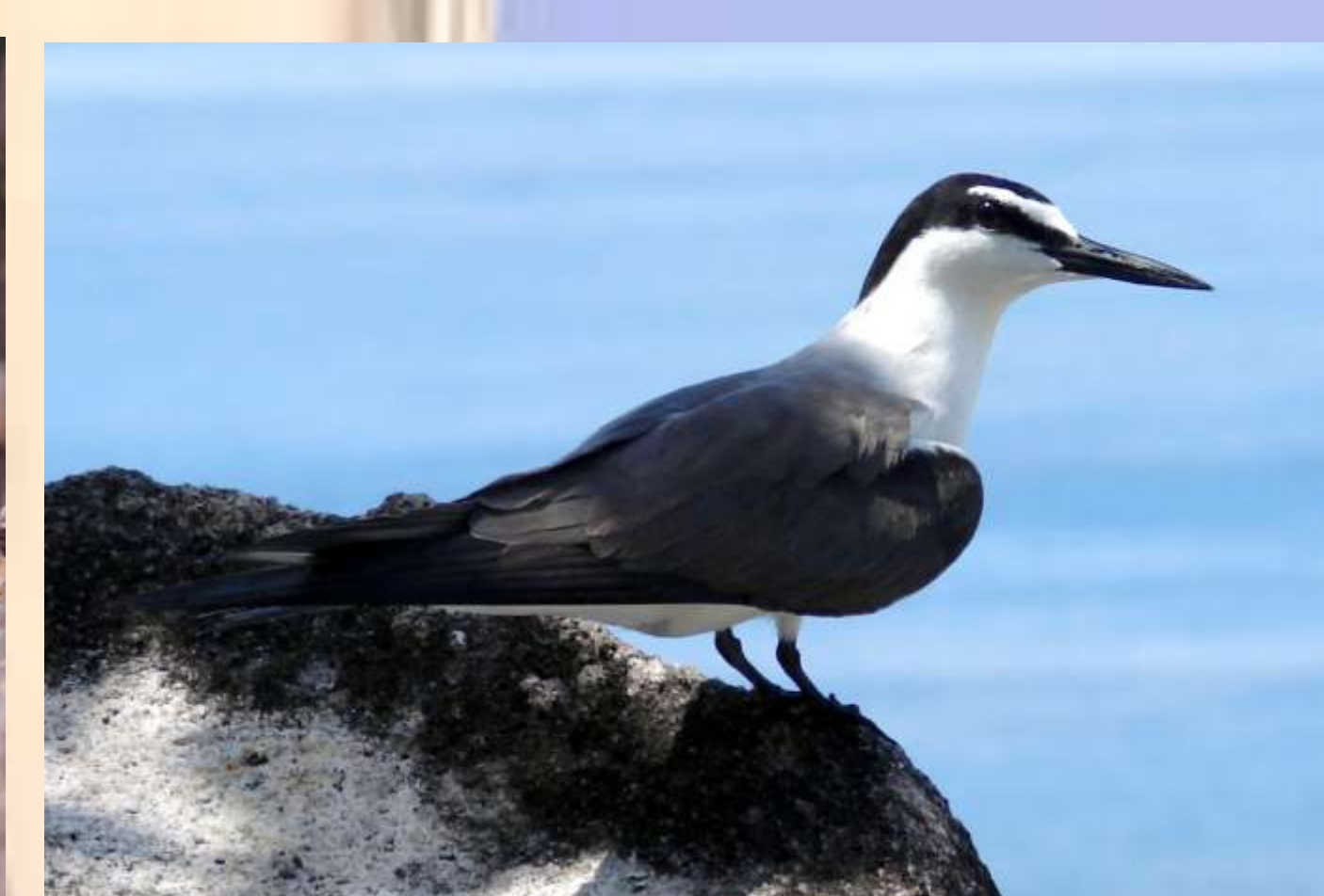
Bridled Tern Sterna anaethetus Distribution in Seychelles: breeds on predator-free islands – Aride, Cousin, Cousine, Récif and other small islands Population: 4,000 pairs