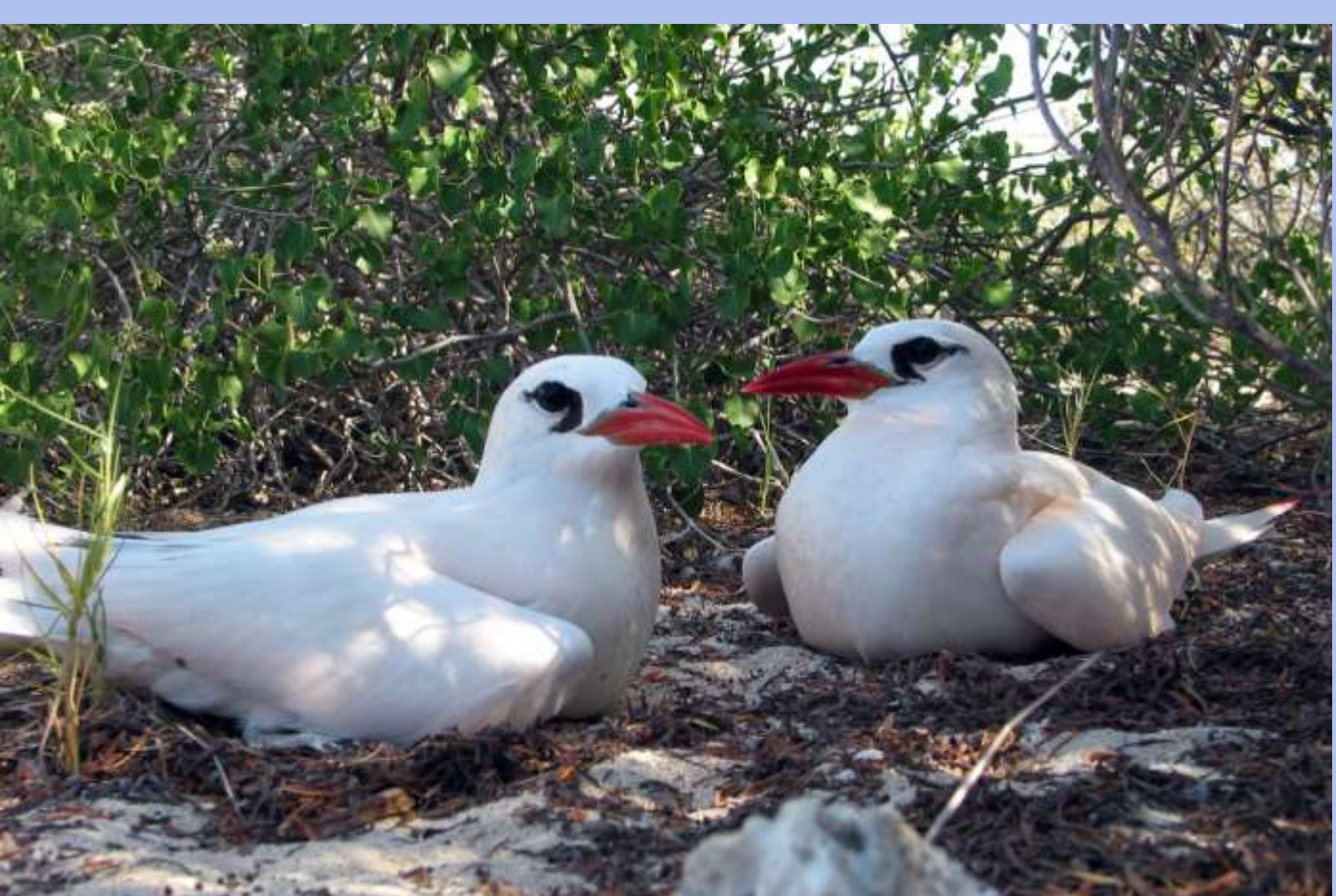
Red-tailed Tropicbird Phaethon rubricauda Distribution in Seychelles: breeds on Aride and Aldabra Population: only 3-5 pairs on the granitic islands; over 2,000 pairs on Aldabra