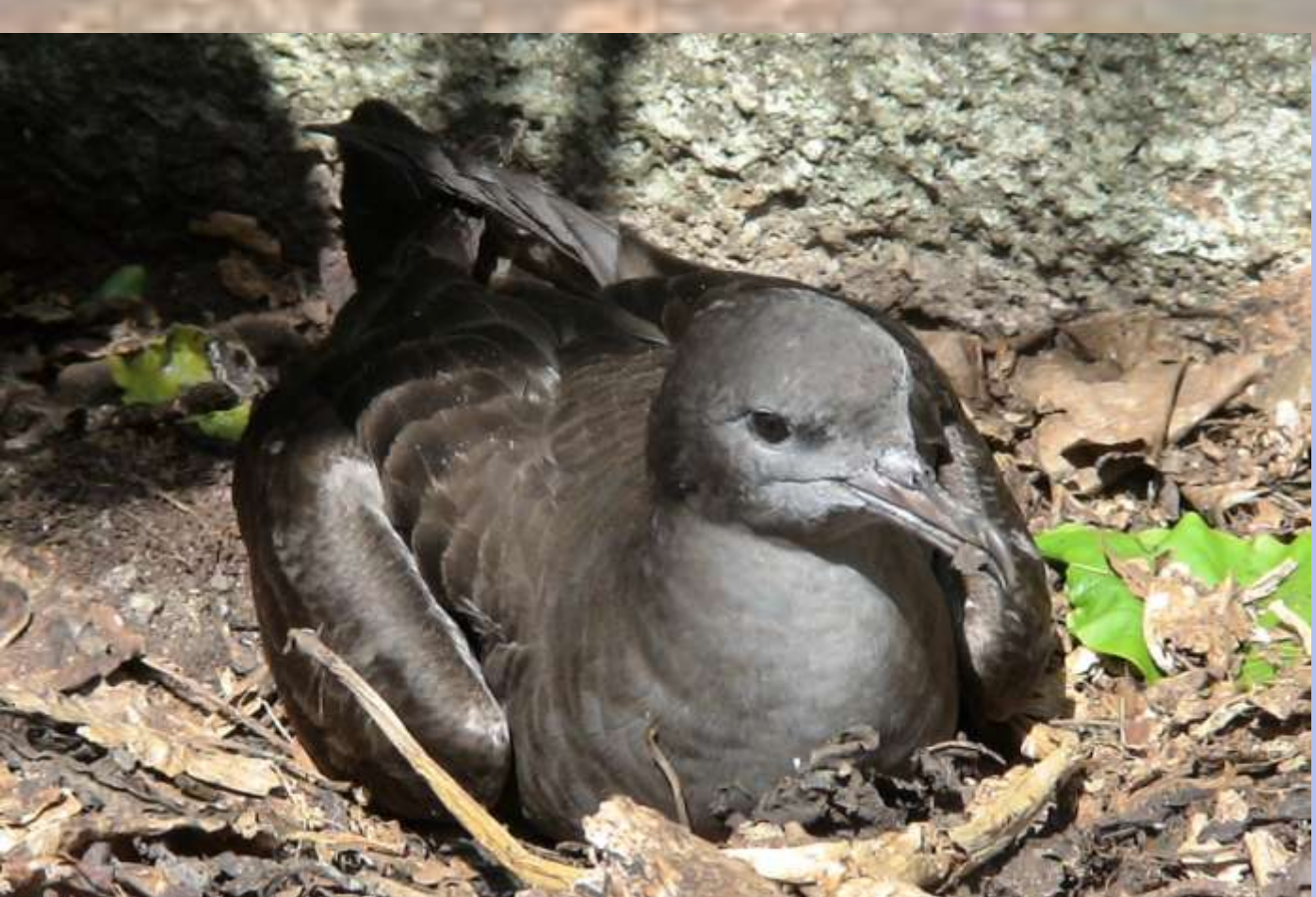
Wedge-tailed Shearwater Puffinus pacificus Distribution in Seychelles: breeds on predator-free islands – Aride, Bird, Cousin, Cousine, Récif, Mamelles and in the Amirantes to the South Population: About 85,000 pairs