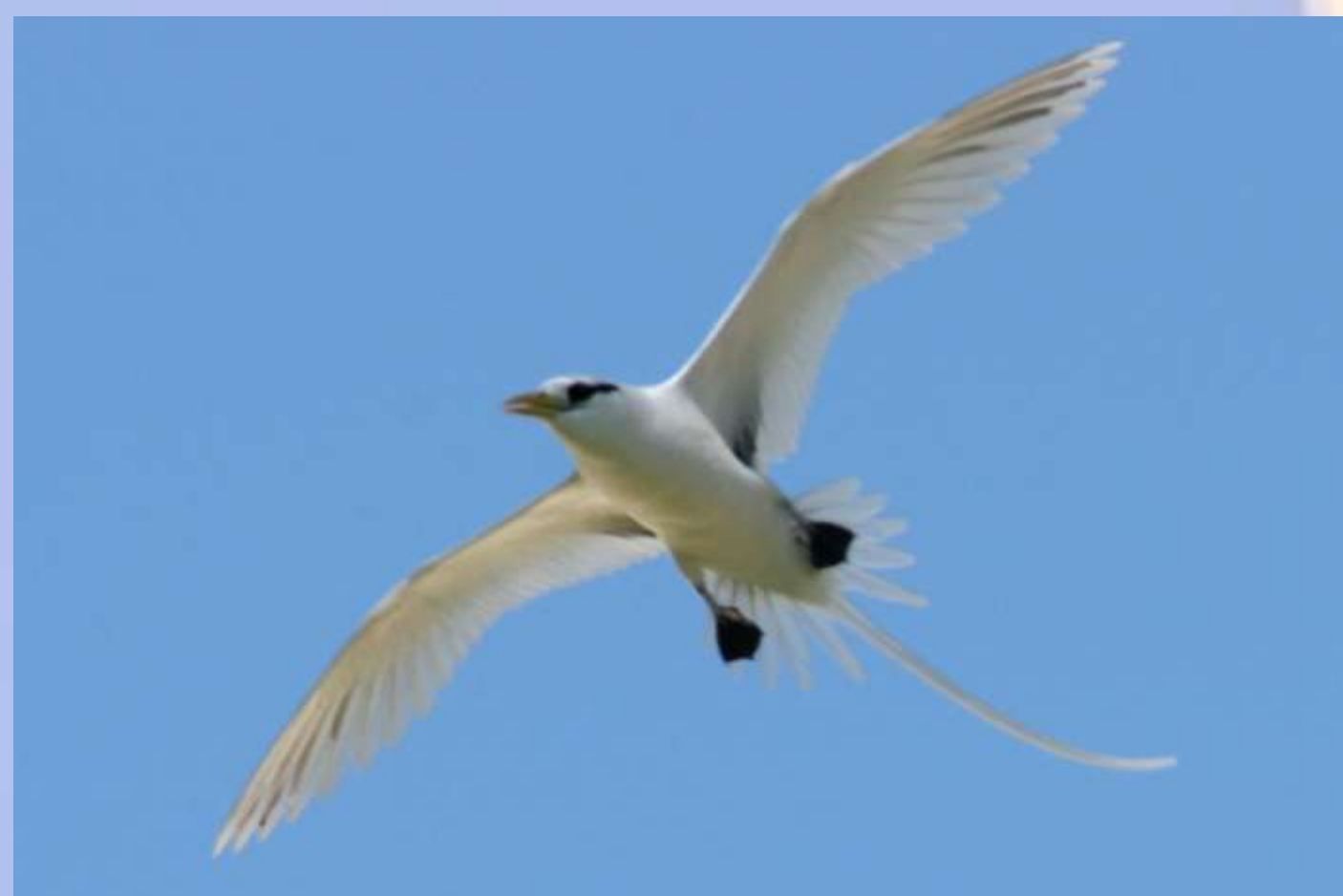
White-tailed Tropicbird Phaethon lepturus Distribution in Seychelles: breeds on almost all islands Population: At least 5,000 pairs on the granitic islands; with 2,500 pairs on Aldabra