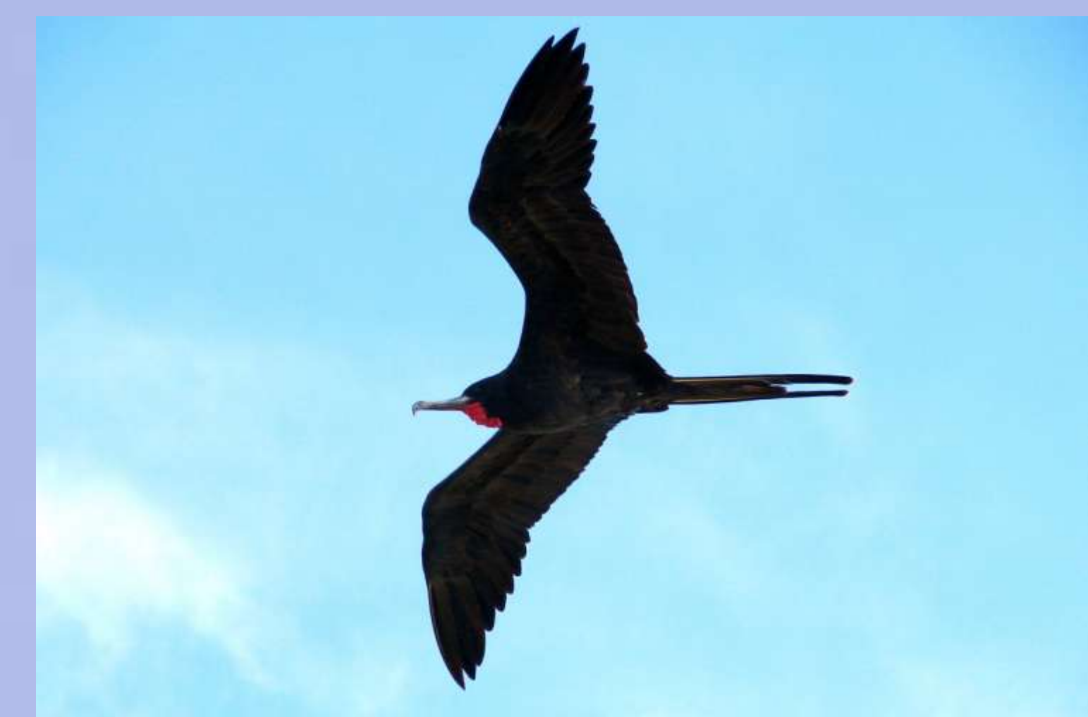
Great Frigatebird Fregata minor Distribution in Seychelles: occurs throughout Seychelles, breeds only on Aldabra and nearby islands Population: at least 4,000 breeding pairs