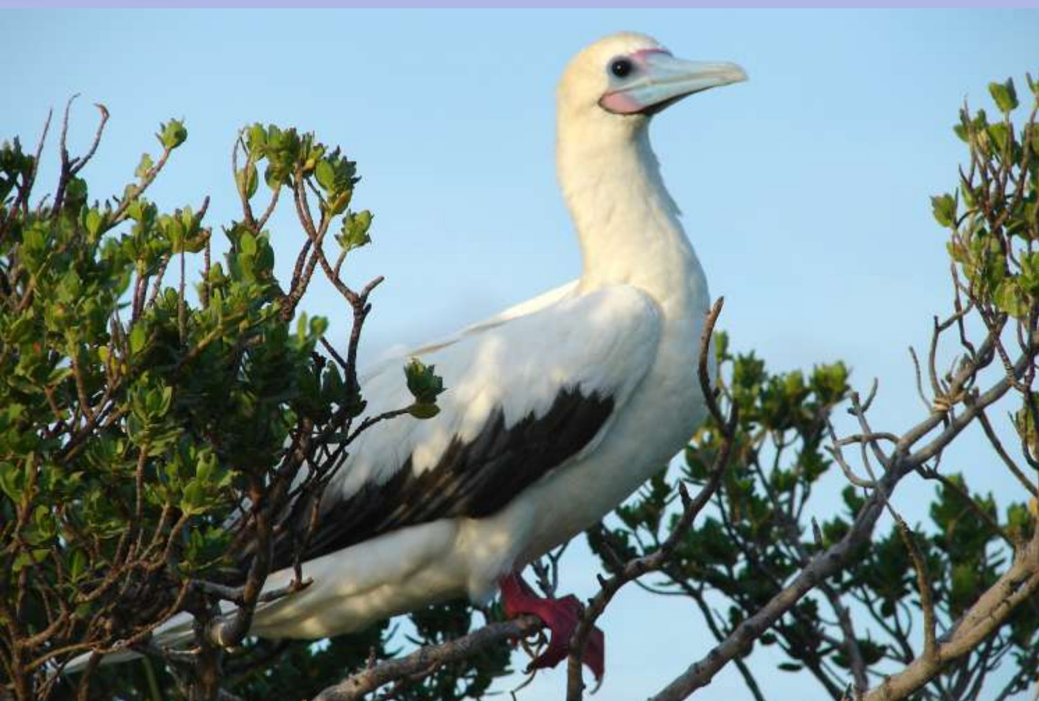
Red-footed Booby Sula sula Distribution in Seychelles: Aldabra and Cosmoledo and some other outer islands. Population: about 25,000 pairs