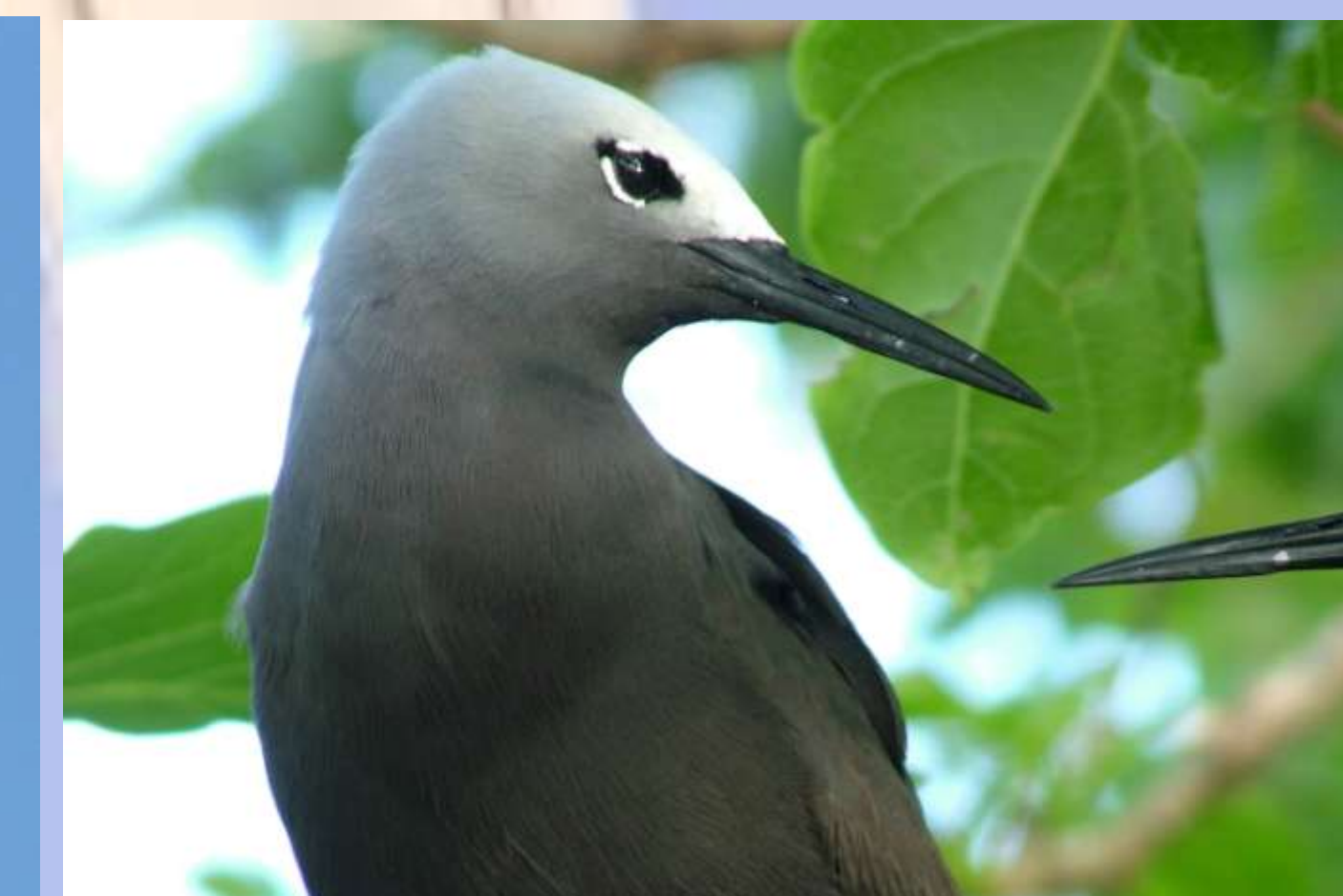
Lesser Noddy Anous tenuirostris Distribution in Seychelles: breeds on rat and cat free islands including Aride, Bird, Cousin, Cousine and Frégate Population: at least 300,000 pairs