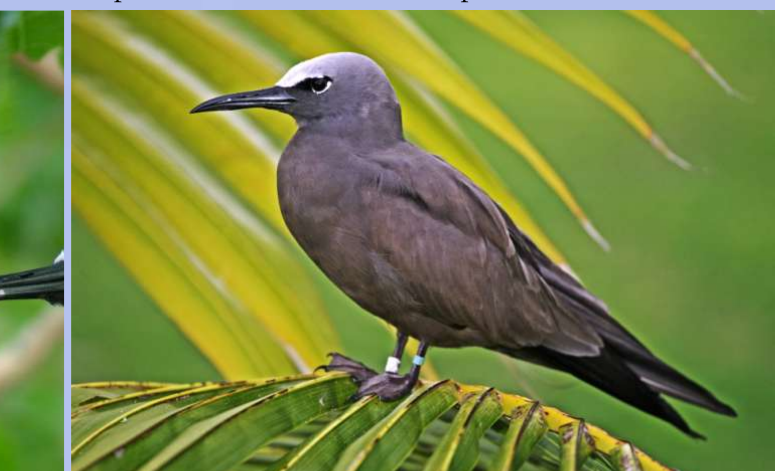
Common or Brown Noddy Anous stolidus Distribution in Seychelles: breeds on predator-free islands and all coral islands Population: about 30,000 pairs

This poster has been produced as part of the Public Education and Advocacy Programme of the Global Environment Facility (GEF)/World Bank funded project "Improving Management of NGO and Privately Owned Nature Reserves and High Biodiversity Islands in Seychelles". This project is a partnership between Nature Seychelles and Cousine Island Ltd.