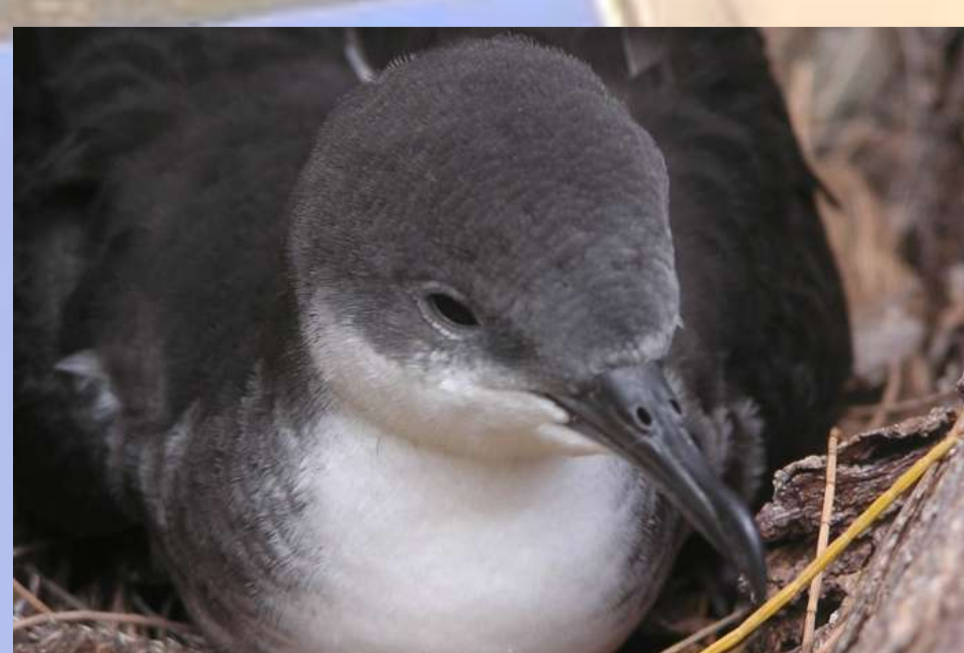
Audubon's Shearwater Puffinus lherminieri Distribution in Seychelles: breeds on predator-free islands – Aride, Bird, Cousin, Cousine, Recif, Mamelles and in the Amirantes and Aldabra to the South Population: About 60,000 pairs