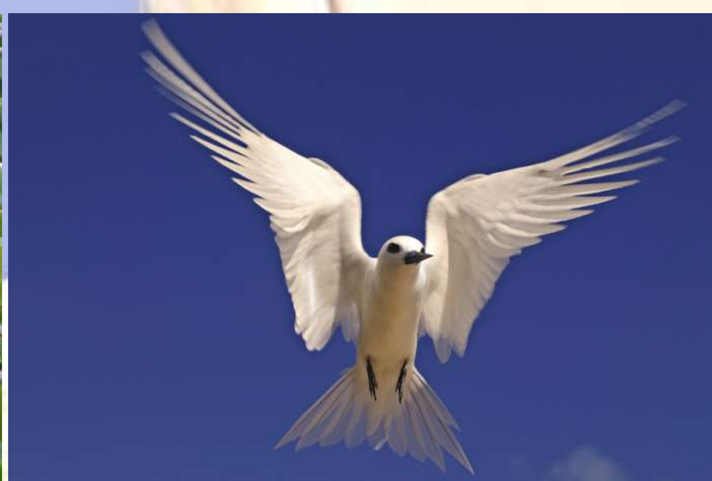
Fairy Tern or White Tern Cygus alba Distribution in Seychelles: breeds on all islands Population: At least 14,000 pairs on granitics, several thousand more pairs on outer islands.

Seychelles islands are nesting grounds for about 18 species of seabirds. Many seabirds breed during the southeast season, from April or May onwards. Species like the Lesser Noddy and Sooty Tern form large breeding colonies, with many thousands of birds all breeding at the same time in the same location. Others, like the Fairy Tern and the White-tailed Tropicbird, breed alone in pairs at different stages of nesting and chick-rearing all year round.