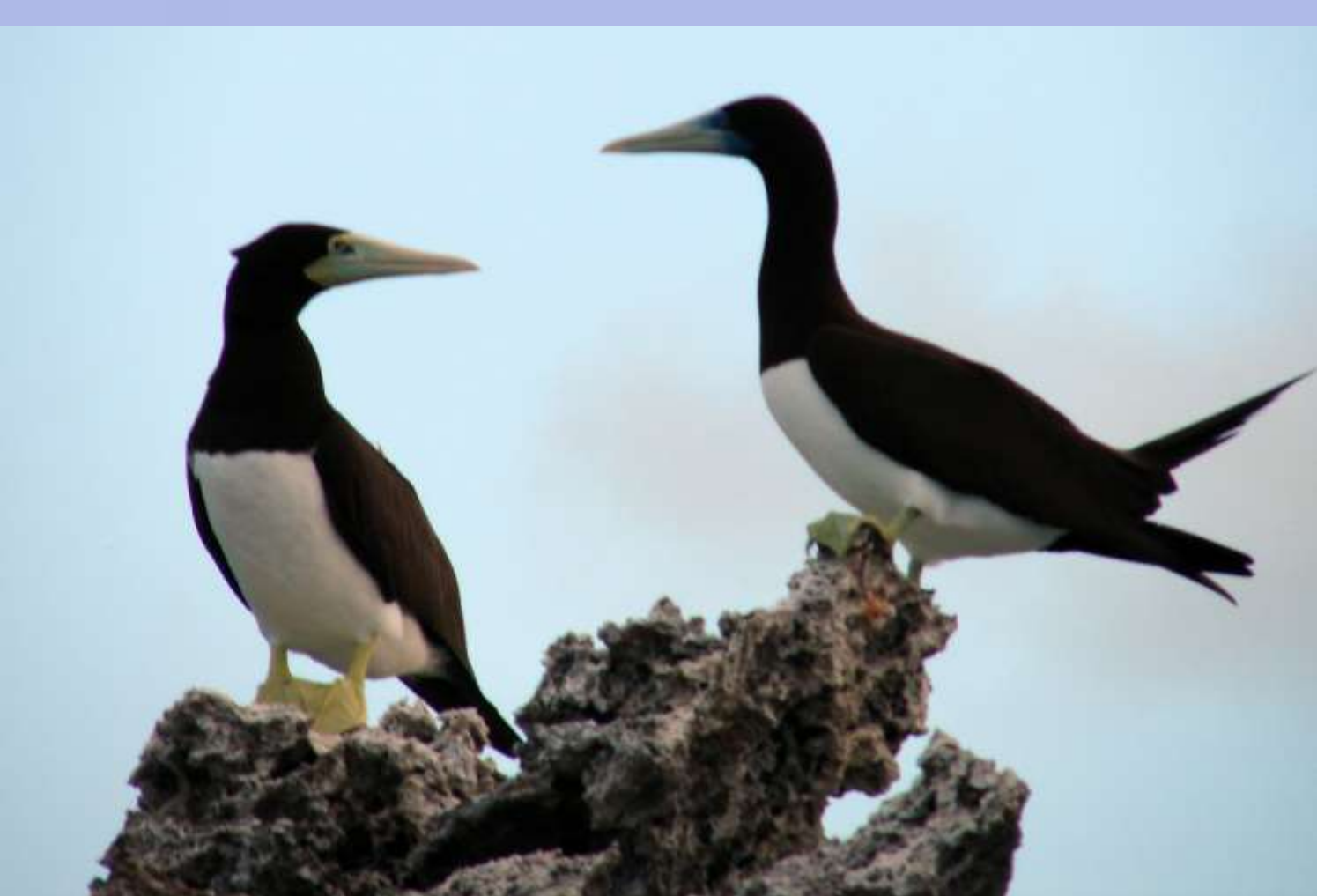
Brown Booby Sula leucogaster Distribution in Seychelles: Cosmoledo Population: about 60 pairs