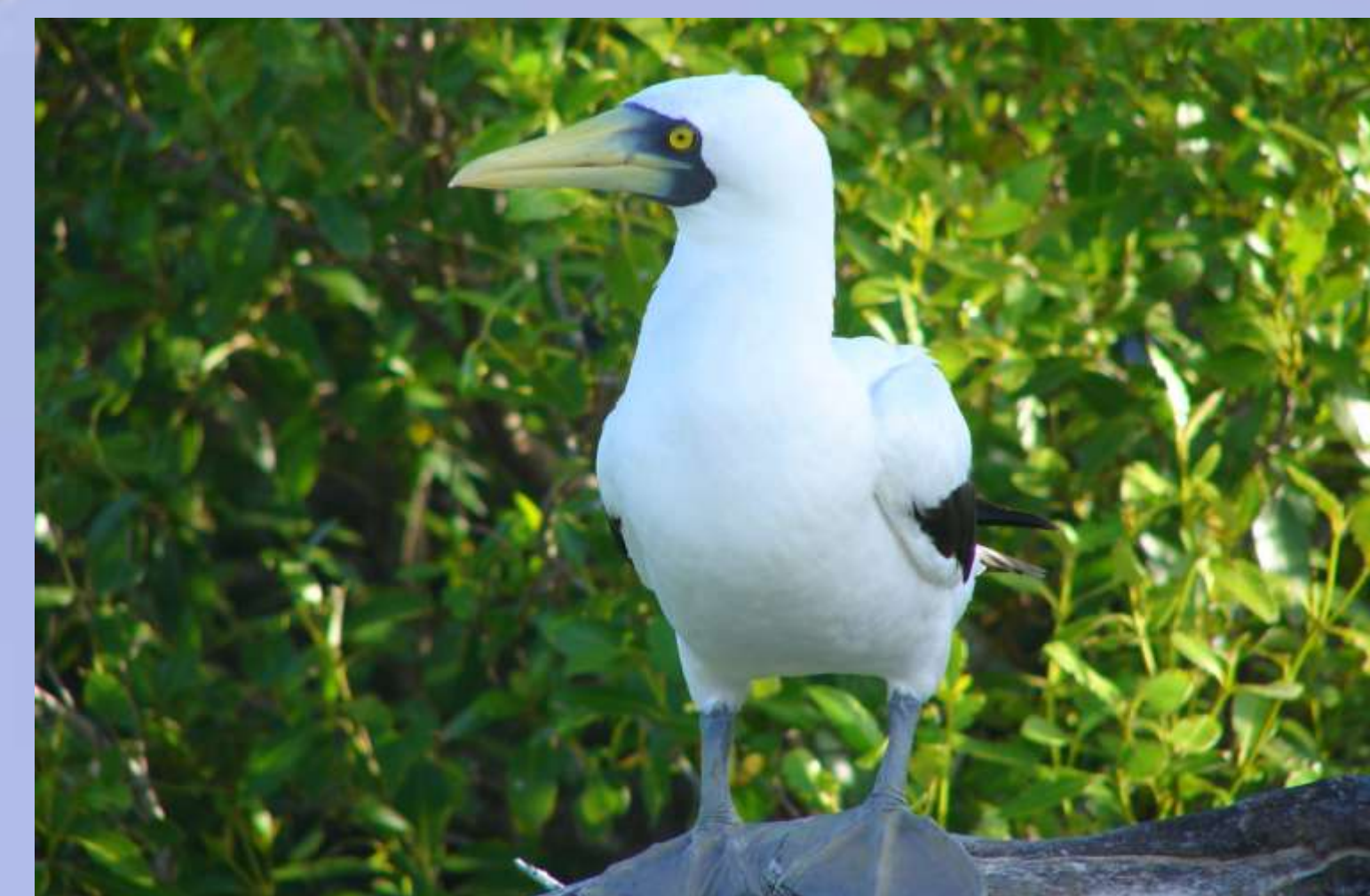
Masked Booby Sula dactylatra Distribution in Seychelles: Cosmoledo and Boudeuse Population: about 9,000 pairs